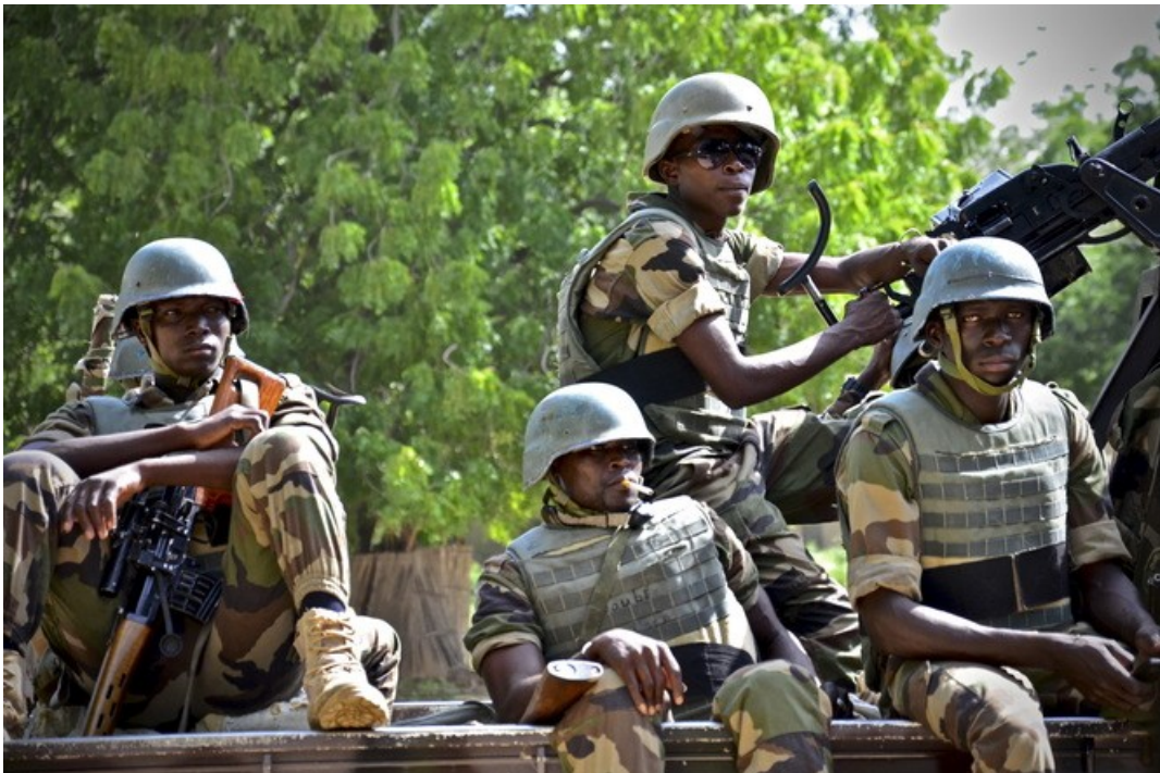
Troops from Niger guard an anti-Boko Haram summit.

Harassed by the Nigerian army and the troops of the international coalition, its ranks have started to dwindle. Its forces now tend to hide in the Sambisa forest and in the islands of Lake Chad which are reputedly difficult to access. Instead of relying only on quick attacks with the help of their motorbikes, they are increasingly using suicide bombings . And while those tactics reflect the group’s thinning numbers, they are also having notable effects on the societies they’re targeting.