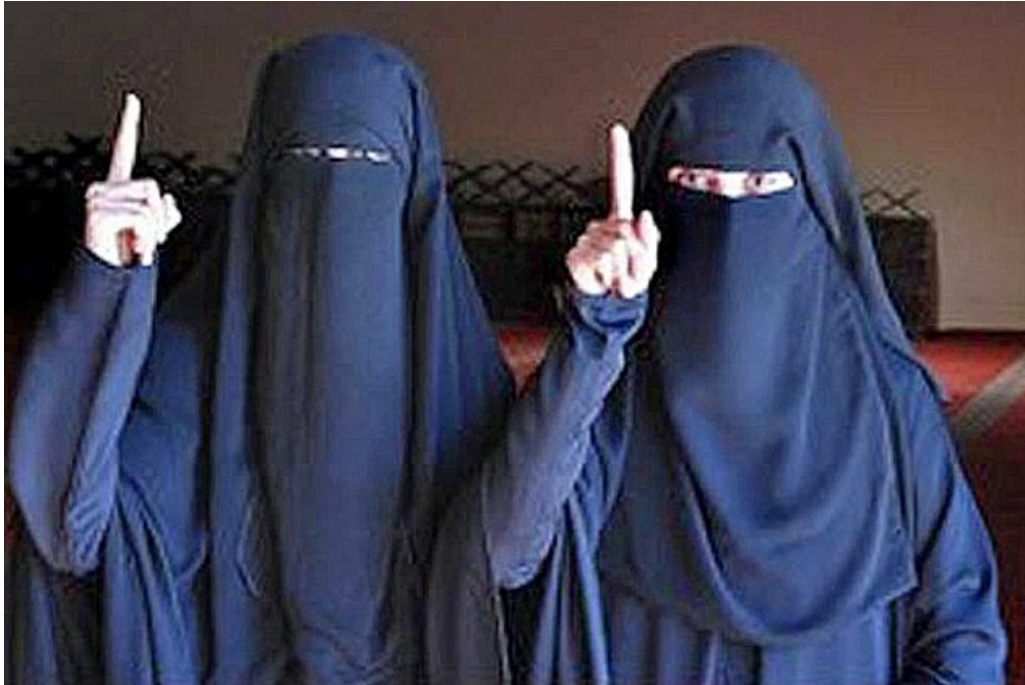
The two girls in their new life in a pic posted online. They attended sermons given by Tejma

Investigators saw a constant stream of Salafist Muslims during their operation on Tejma.